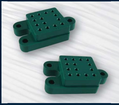
Mates with MIL-R-6106 & MS27743 Relays